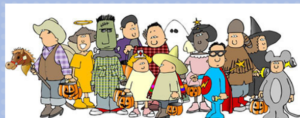
Storybook Character Parade

Storybook Character Parade Friday, March 8 @8:30 am Students should come to school dressed as their favorite storybook character on Friday, March 8. We will have a character parade at 8:30 and parents are welcome to come and watch.